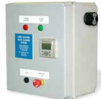
The E-Pro® Control Panel